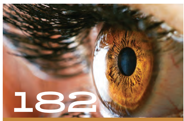
CORNEAS HAVE BEEN DONATED FOR TRANSPLANTS THROUGH THE GREAT PLAINS LIONS EYE BANK.