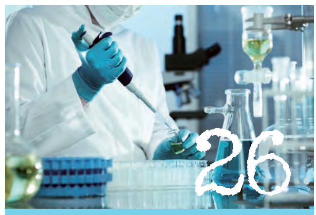
NEW WORKSTATIONS WITH HOODS WERE ADDED TO A FORMER 2,000-SQUARE-FOOT CLASSROOM TURNED LABORATORY WHERE SCHOOL OF PHARMACY STUDENTS IN AMARILLO WILL LEARN HOW TO PROPERLY PERFORM STERILE COMPOUNDING. THE STERILE LABORATORY NOW OFFERS A SPECIALIZED TYPE OF TRAINING THAT NO OTHER U.S. PHARMACY SCHOOL CAN PROVIDE.

OF THE SCHOOL OF MEDICINE'S STUDENTS WILL COMPLETE THEIR RESIDENCES AT TTUHSC AND MORE THAN HALF WILL COMPLETE THEIR RESIDENCIES IN TEXAS.